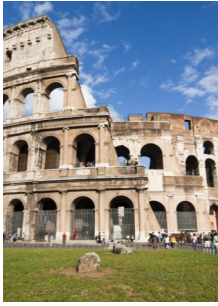
Next year's international symposium will be held in Rome, Italy amidst historical landmarks like the Coliseum

Next summer, systems engineers from around the world will meet in Rome, Italy for the INCOSE International Symposium 2012 (IS2012). The conference will take place from July 9 through 12, 2012.