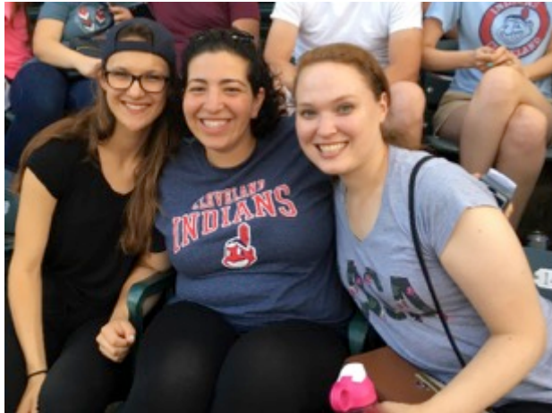
NASA Interns enjoying the game with the Chapter