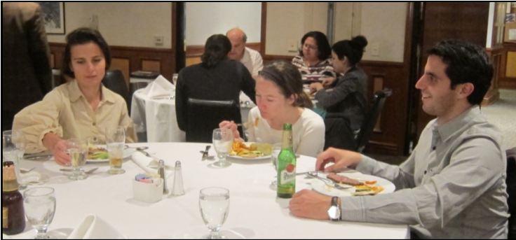
Bons vivants at the 2013 INCOSE-LA Holiday Party. (left)

Time ran out before those in attendance were finished talking, but there is always the aforementioned Strategic Planning Meeting at which the discussions can be resumed and resolutions determined. The Board of Directors would like to thank those members who took the time to attend and to provide their valuable inputs. The Board would also like to express its appreciation to the members and volunteers who have done so much to make this Chapter of value to the membership at large.