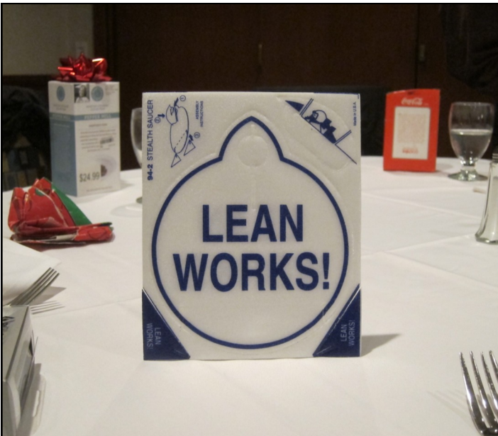
The year-end Holiday Party at the Marina Del Rey Yacht Club featured fellowship, networking, fine dining, and a gift exchange, including the "LEAN WORKS" stealth saucer pictured here.