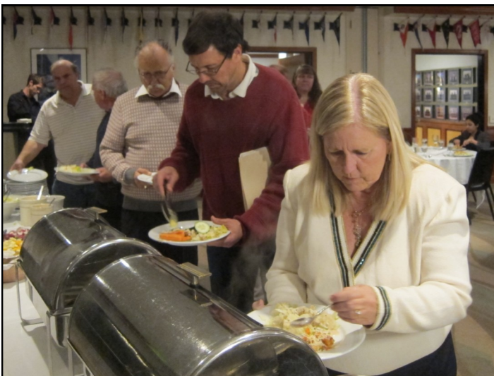
Bons vivants at the 2013 INCOSE-LA Holiday Party.