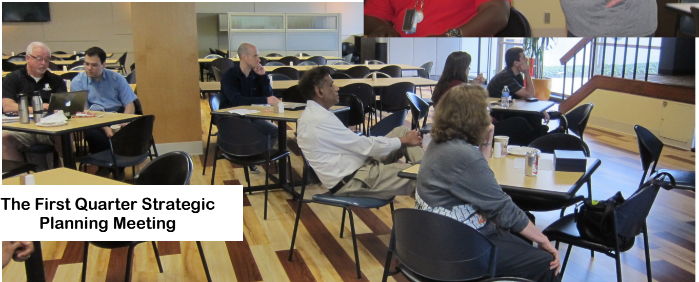
The First Quarter Strategic Planning Meeting