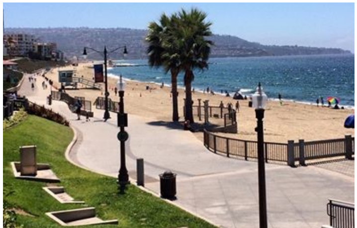
The neighborhood around the Crowne Plaza, venue for CSER 2017

CSER 2017 will be more than excellent papers, knowledgeable and erudite speakers, and a top-notch venue. The success of conferences such as this is tied to the sponsors who support the conference, and the INCOSE-LA team is well on their way to signing up a stellar group of sponsors, such as sponsored the CSER 2014 and the 2016 Regional Mini-Conference. There is always room for additional volunteers: developing electronic media and publicity, supporting panels, working with the sponsors, registering participants, and providing real-time coordination. Interested in joining this stellar team? Please contact Phyllis Marbach at prmarbach@gmail.com .