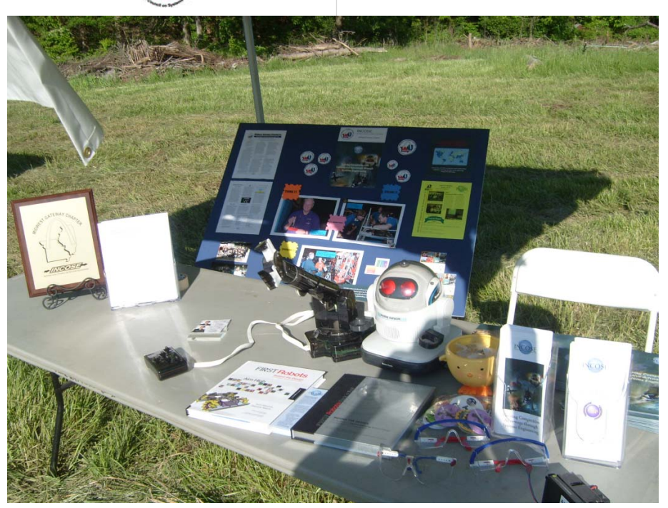
INCOSE MG Table at an Outreach Event sponsored by The Boeing Company.

By the way, another trait of a systems thinker is one who asks lots of questions. In the preceding article, did you notice that there were only two sentences that were not questions?!