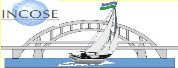
Hampton Roads Area