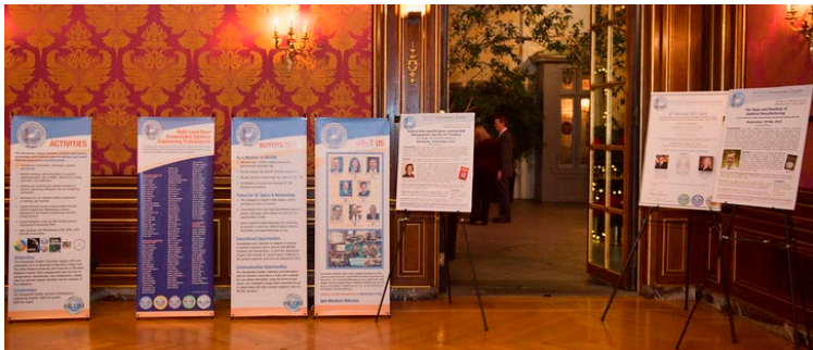
Chesapeake Chapter Marketing Materials

INCOSE Chesapeake Chapter , as several others, used their grant to create permanent display materials to spread the systems engineering and INCOSE word. The Chapter leveraged in-kind support to produce the materials and increase marketing activities.