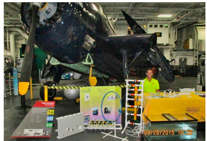
Some of the many science experiments and hands-on demonstrations presented by teachers and students