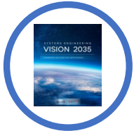
Systems Engineering Vision 2035