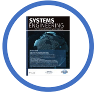
Systems Engineering Journal