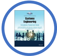
Access to Guides and Primers