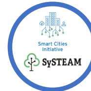
Working Groups & Initiatives