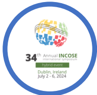
Annual International Symposium