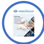
INCOSE Members Newsletter