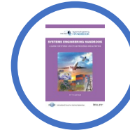
Systems Engineering Handbook