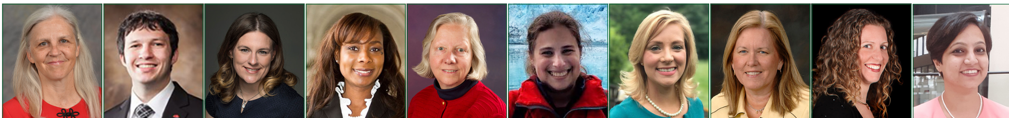
Current EWLSE Leaders