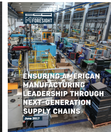
Next Generation Supply Chains