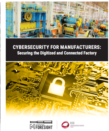
Cybersecurity for Manufacturers