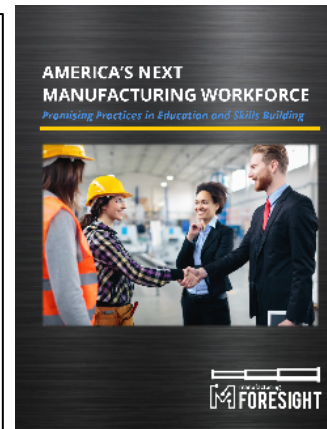
Education and Skills Building