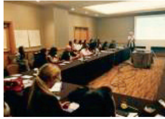
A well-attended IS2015 EWLSE Inaugural Meeting.

We welcomed nearly 50 men and women in attendance at the inaugural INCOSE IS 2015 Empowering Women as Leaders in Systems Engineering (EWLSE) meeting on July 14, 2015.