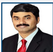
Dr. Satheesh Reddy Secretary, Defence R&D, Chairman, DRDO