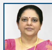
Dr. Tessy Thomas DS & Director General (Aero), DRDO