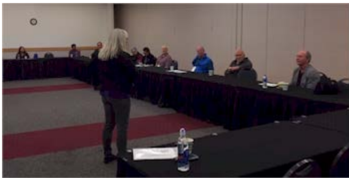
Full Life Cycle Attention by System Developers