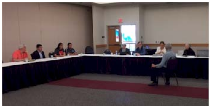
Problem Space Focus Before Solution Work