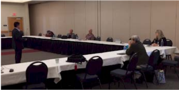
Verification and validation of SE Models