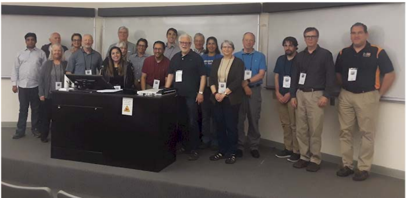
Group photo of those attending the final brief out summary of all workshops (some left early for travel)