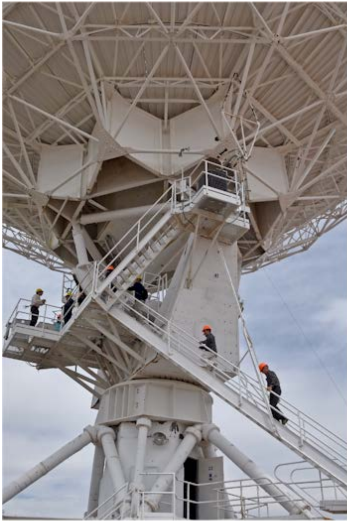
Going inside a Very Large Array antenna, touring the inside instrumentation rooms, then standing in the dish