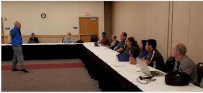
Student involvement in Chapter & Working Group activity