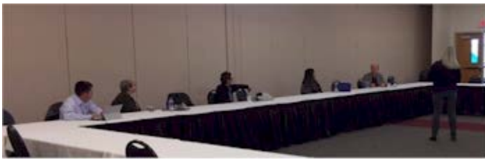
Women as leaders in Systems Engineering