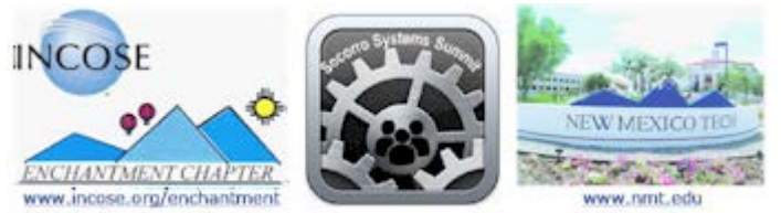
April 2019 Socorro Systems Summit