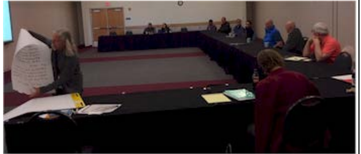
Mixed Discipline SE Training