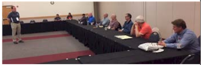
Autonomous systems complexity assessment