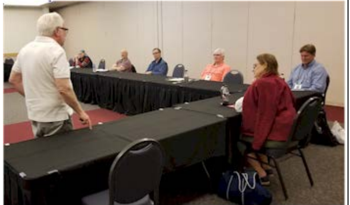
Agile SE in Mixed Discipline Projects