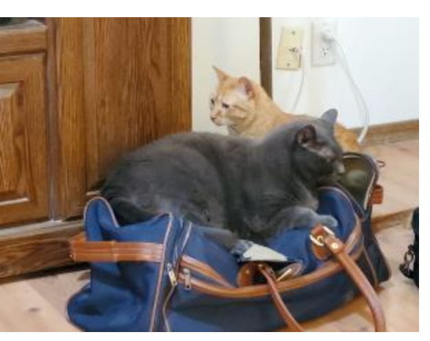
Shown here is our chapter treasurer's cats: Loki and Newman, trying to engineer their way into her husband's duffle bag

Systems engineering also plays a role in the development of petfriendly environments. Systems engineers work with architects, landscape architects, and other professionals design and develop spaces that are safe and comfortable for includes pets. This everything from designing outdoor spaces with pet-