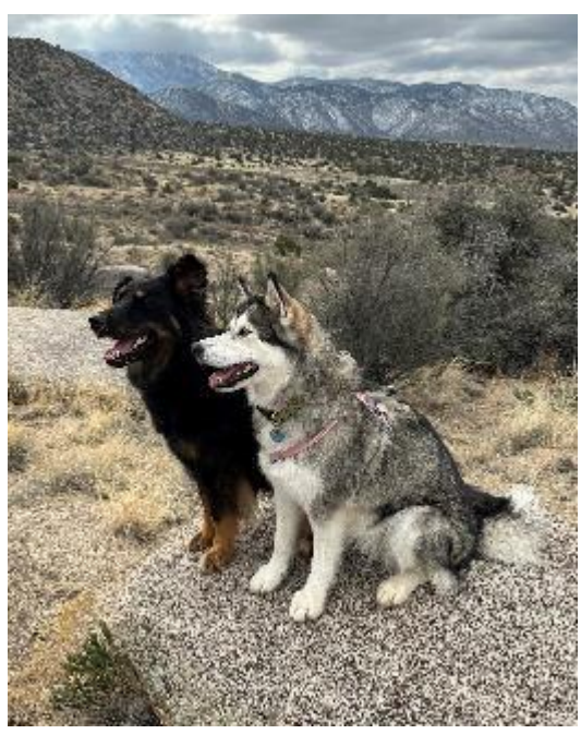
Shown here are our chapter president's dogs: Chloe is a 4-year-old Malamute and Hazel is a 4-year-old super Mutt (at least

One of the primary areas where systems engineering plays a role in a society with pets is in the design and development of pet care systems. These systems include everything from pet food and water dispensers to automated litter boxes and doors. Systems engineers use their expertise to design these systems in a way that makes them easy to according to the doggie DNA test). use and maintain, while also