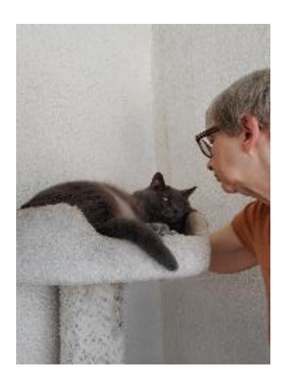
Shown here is our chapter treasurer with her cat Loki who is trying to engineer a nap in the top level of the cat tree.

ensuring that they provide the necessary care and support for pets.