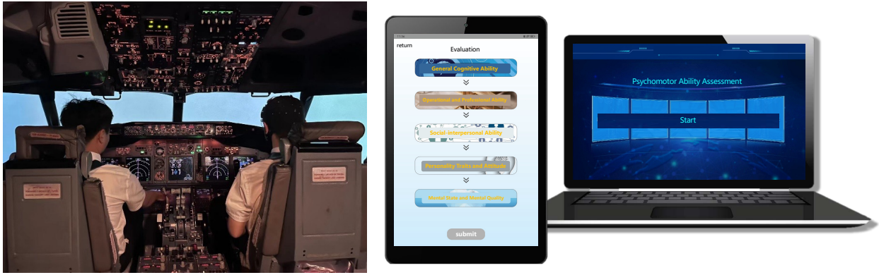
Figure 1. Apparatus (The tablet in the middle is used to assess pilots' general cognitive ability and social-interpersonal ability, while the computer on the right is primarily employed to evaluate pilots' psychomotor abilities.)