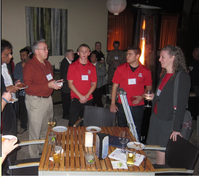
Bons vivants at the Chapter-hosted soiree at 2014 INCOSE International Workshop (above) and Christmas party (below)