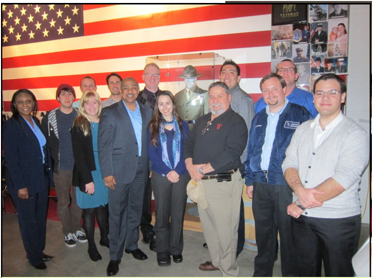
ABOVE, AT A PAST NETWORKING EVENT INCOSE-LA GOES FULL METAL JACKET