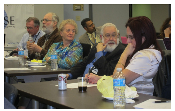
Intergenerational: growing young systems engineers (upper left) and polished veterans (above), working together

Time ran out before those in attendance were finished talking, but there is always the aforementioned Strategic Planning Meeting at which the discussions can be resumed and resolutions determined. The Board of Directors would like to thank those members who took the time to attend and to provide their valuable inputs. The Board would also like to express its appreciation to the members and volunteers who have done so much to make this Chapter of value to the membership at large.