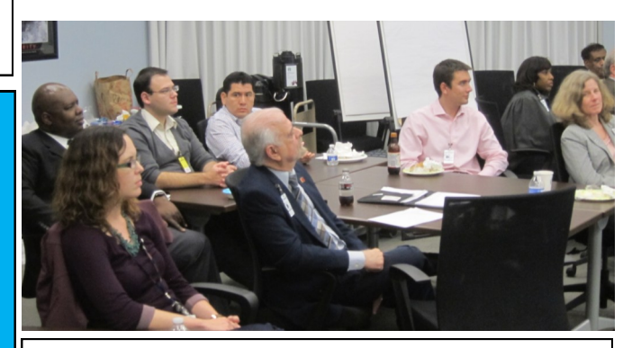
Participants in the January, 2015 Town Hall meeting, above

Go to the INCOSE website for details http://events.incose.org/