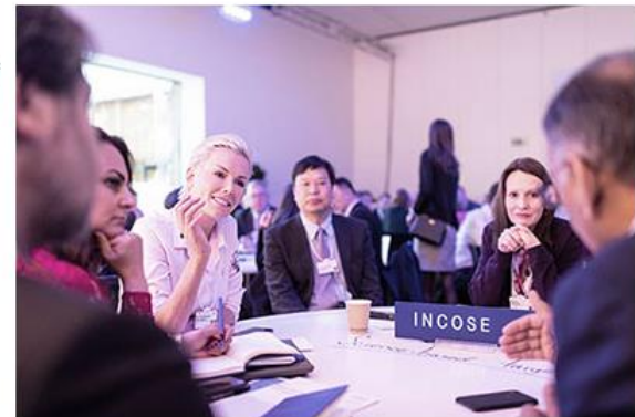
Virtual Networking via Chat

This event will now be held virtually/online from the convenience of your home or office. All presentations will be viewable using a web browser - no software installs are required.