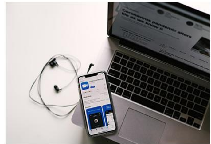
100% Virtual Event

See the main menu for more information, including keynote speakers , programs and registration .