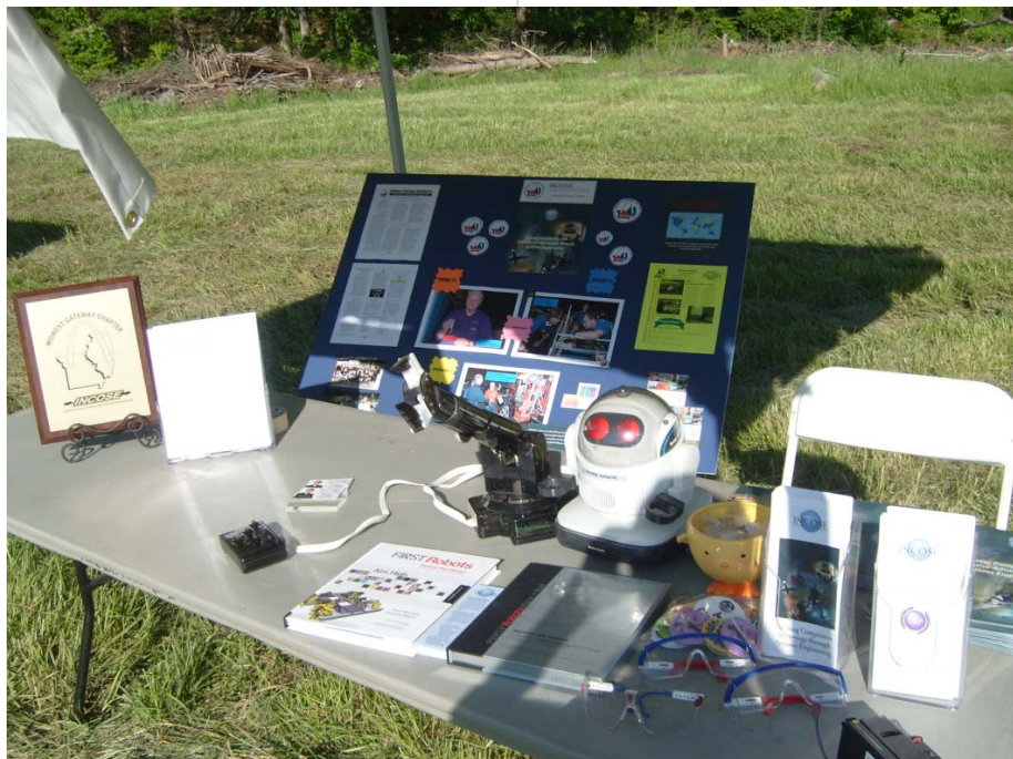
INCOSE MG Table at an Outreach Event sponsored by The Boeing Company.

By the way, another trait of a systems thinker is one who asks lots of questions. In the preceding article, did you notice that there were only two sentences that were not questions?!