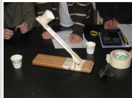
Team 2's shooter