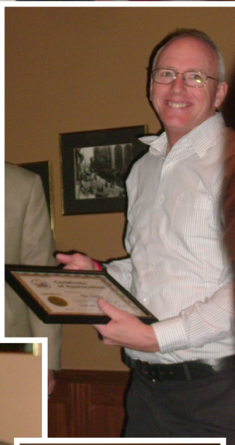
Photos from the Dec. 2010 Member Appreciation Social Event