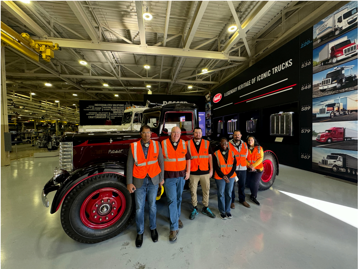
Chapter End of Year Event! - Main Event November 16th