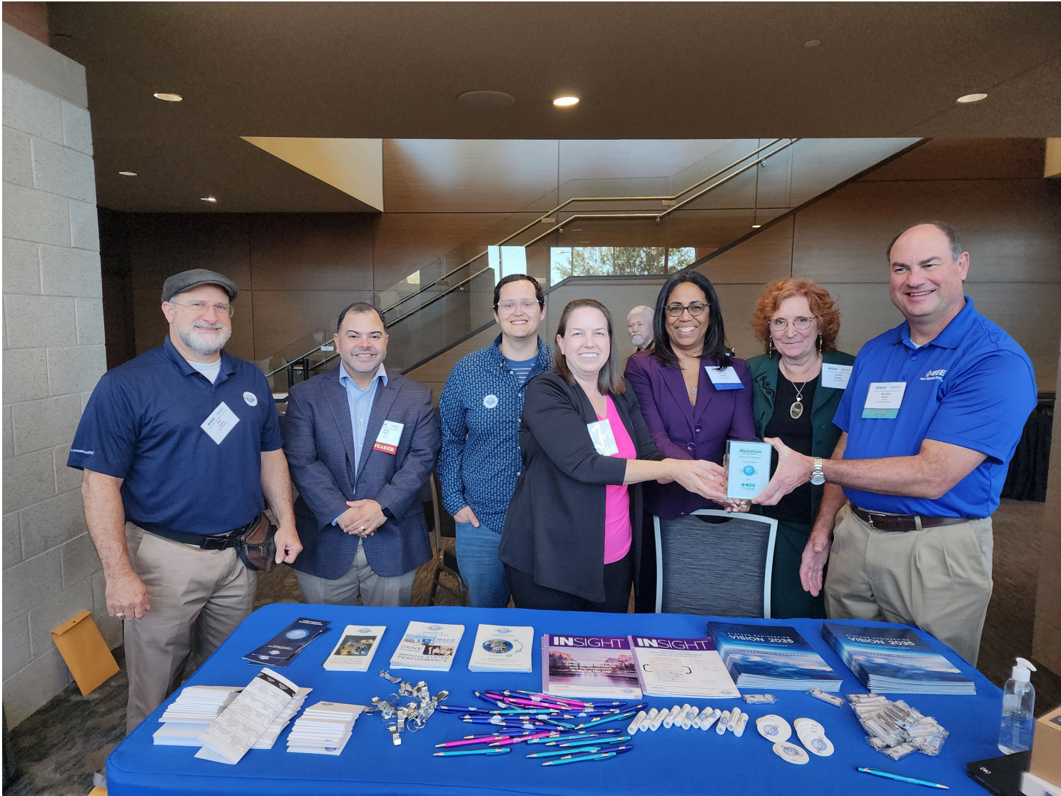
INCOSE NTX Tour Event - Peterbuilt Denton, TX November 15