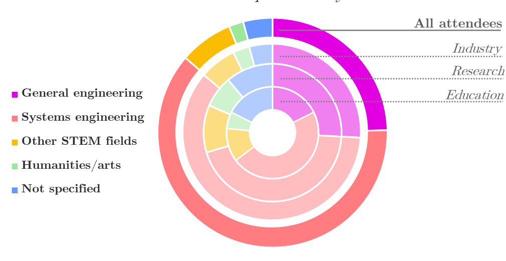
Figure 3. Mini-conference attendees specialties/areas of expertise, broken down by sector. Each sector is represented by a di^erent ring, as noted by the labels on the right, while each area of specialty is represented by a di^erent color (as indicated by the key on the left).