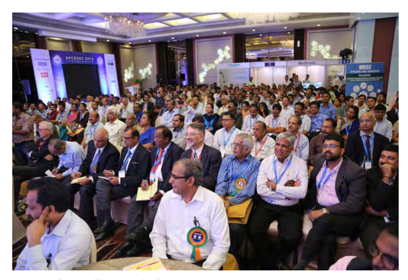
Figure 1. The well-attended APCOSEC 2016

NCOSE India Chapter and Indian Society of Systems for Science & Engineering (ISSE) jointly organized APCOSEC 2016, the 10th Asia-Pacific Council on Systems Engineering Conference (APCOSEC), in Bangalore, India from 9th to 11th November, 2016. The theme for this conference was "Systems Engineering in Asia Oceania - Success Stories & Challenges." This was the first and largest international systems engineering conference organized by INCOSE in India, and it received a phenomenal response - attended by over 400 delegates from India, Australia, France, Germany, Japan, South Africa, South Korea, the UK, and the US across various sectors including space, aerospace, defense, nuclear, automotive and healthcare, and more!