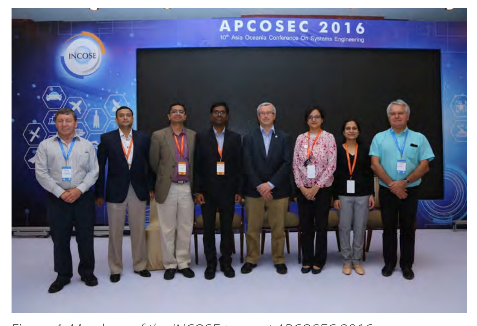
Figure 4. Members of the INCOSE team at APCOSEC 2016