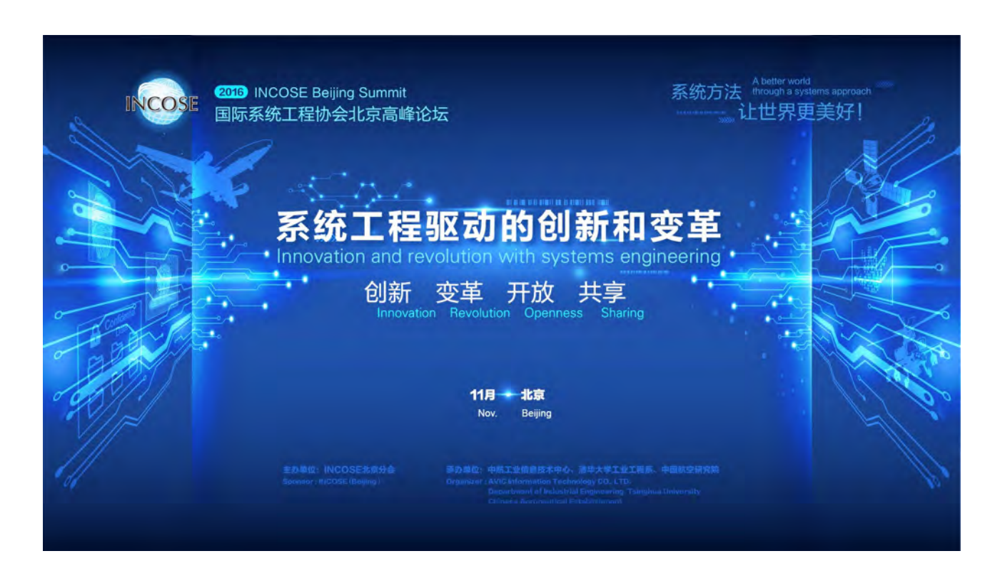
Figure 5. Advertisement for the INCOSE Beijing Summit

Therefore, the first INCOSE Beijing Summit of 22nd November 2016 focused on Innovation and Revolution with systems engineering. Sticking to the objectives of "Innovation, Revolution, Openness, and Sharing," oriented to theoretical research and engineering applications, the Beijing summit not only provided an access for Chinese academia and industry to learn about both the global building of Systems Engineering Body of Knowledge (SEBoK), but also offered an opportunity to keep up with the developing trend of leading practice. Meanwhile, the Summit also provided systems engineering methodology and best practices for Chinese education and industries. INCOSE Beijing plans to gain worldwide recognition for Chinese innovation and manufacturing by integrating into the international systems engineering research and application community actively with its brand new status.