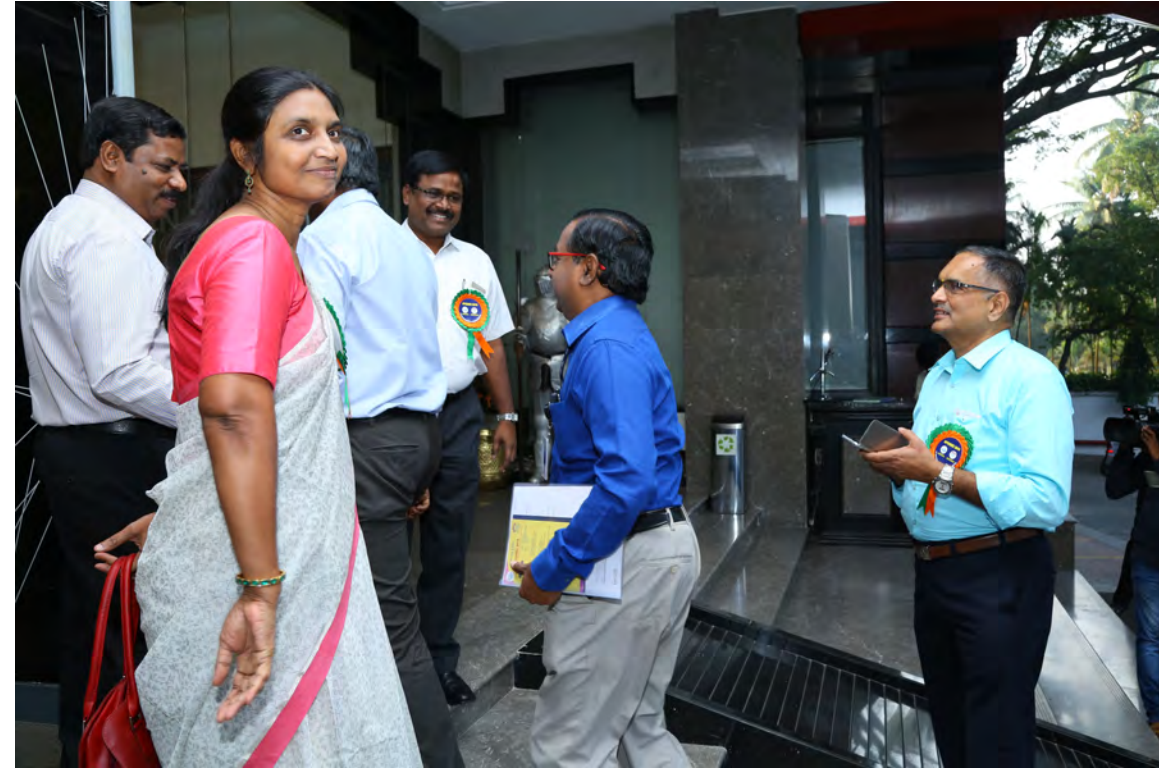
Arriving attendees at the APCOSEC Inaugural Function

Further information will be available through the Sector Directors, and on Connect, once we fully define the process. Where chapters wish to specifically engage in promoting INCOSE, we encourage them to contact the marketing and communications team at marcom@incose. org for further guidance and advice.