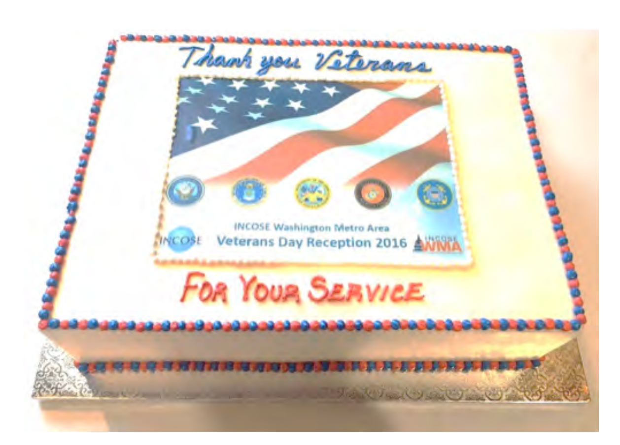
Figure 11. INCOSE WMA Veterans Day Celebration Cake