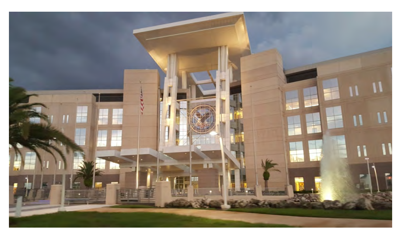
Figure 7. The Orlando Veterans Affairs Medical Center

n 15th September 2016, INCOSE Orlando held their monthly meeting at the new Orlando Veterans hospital, which has come in under budget at over $600 million. Our chapter took an exclusive "behind-the-scenes" tour of the recently opened and very complex Orlando Veterans Affairs Medical Center (VAMC) in Lake Nona, US - FL. This "medical city" includes research companies, universities, and other hospital facilities.