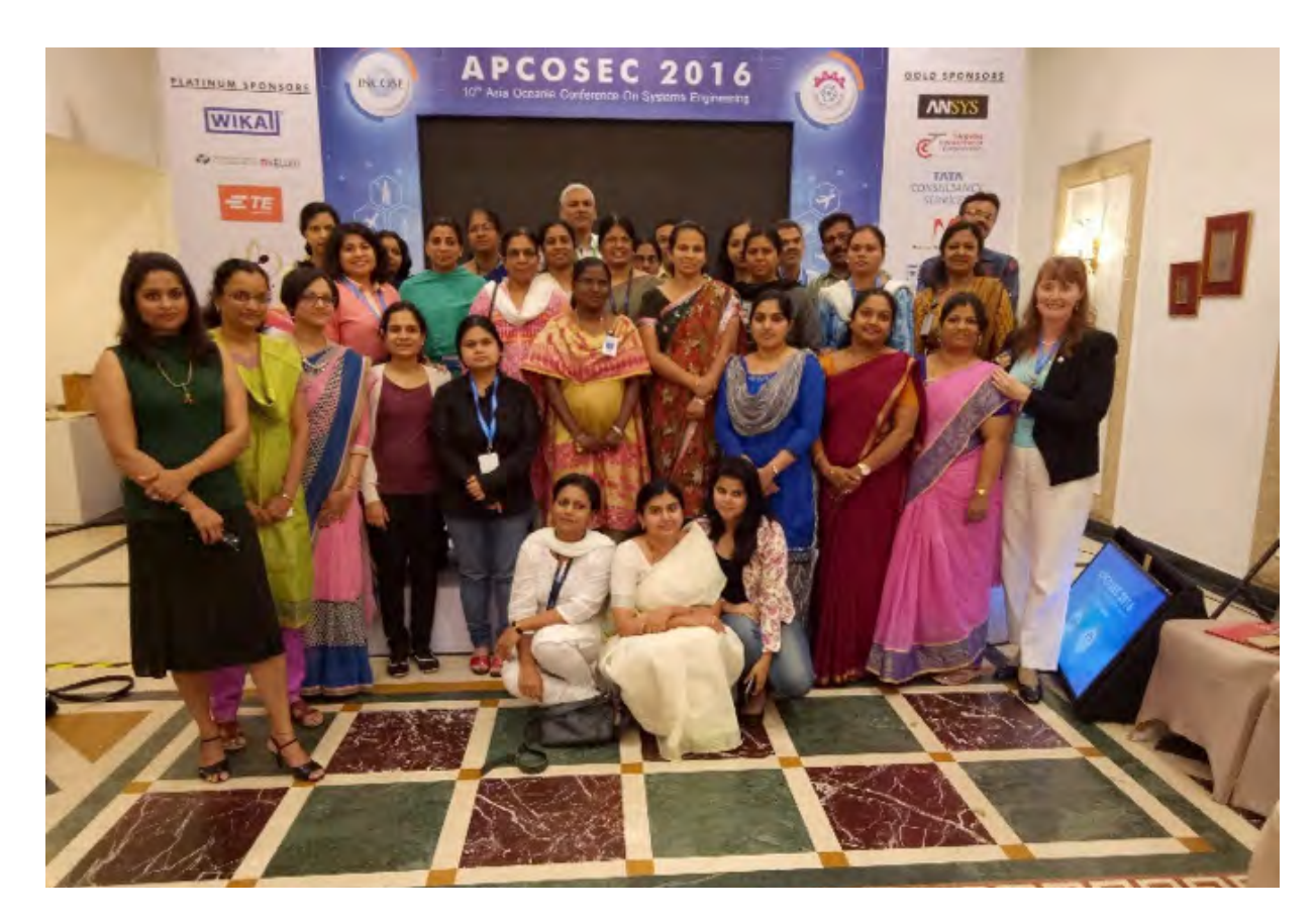
Figure 2. EWLSE workshop attendees