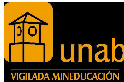
UNAB, Bucaramanga, Colombia